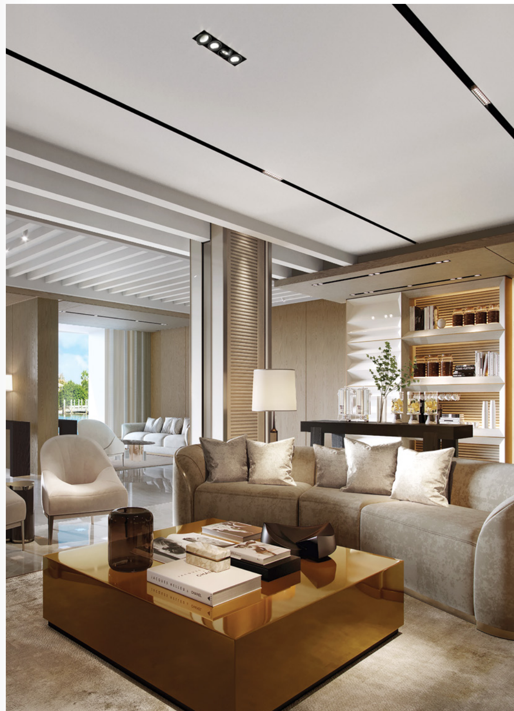
In the waterfront lounge, maritime-inspired materials and a refined palette of colors exude a relaxed aura of coastal calm for residents and guests.

In tandem with the distinguished courtesies of anticipatory service, this suite of masterfully-choreographed amenities not only accommodates, but elevates most any desire; transforming comfort and convenience into an exceptional experience in living.