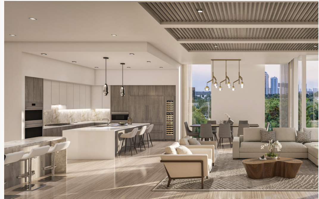
Above: Generously-proportioned kitchens and great rooms feature wet bars with quartz countertops. Below: Private entry foyer, open-concept kitchen with adjoining wet bar and grand master suite.

Private elevators with controlled access ensure the utmost in discretion. A full suite of professional-grade Wolf® and Sub-Zero® kitchen appliances bear witness to memorable social gatherings. Floor-to-ceiling, triple-panel, impact-resistant glass doors and windows preserve an environment of quiet, sumptuous comfort. Outfitted with double walk-in closets, free-standing soaking tubs, glass-enclosed showers and European double-vanities, grand owner's suites are private sanctuaries of refinement and relaxation. Set to raise expectations for well-appointed, waterfront living, here, ocean-inspired elegance reigns supreme.